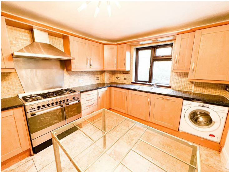
Kitchen/Diner 13'2" x 12'6" (4.03 x 3.82)