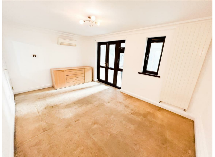
Reception 2 15'7" x 11'1" (4.75 x 3.38)